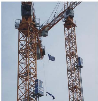
Crane hoist in LIEBHERR tower crane

SC28 AN, the solution for vertical lifting, enabling service and/or access in areas like Bridges, Chimney's, Industrial Plants Radio Towers, Tower cranes, Windmills and anywhere where the need for transporting 1-3 personnel quickly up and down.