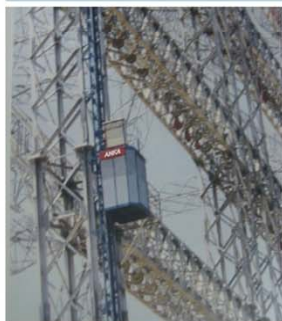
Small size hoist in dam project